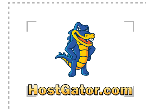
Color Stacked Version Minimum Width 77x74 px