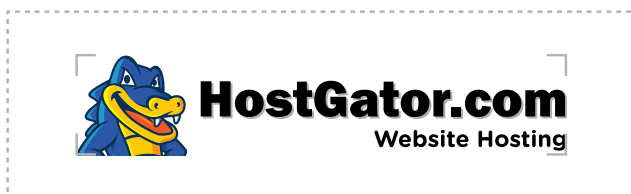
Tiny Color Horizontal Version Minimum Width 127x33 px