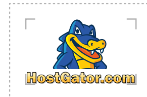
Short Color Stacked Version Minimum Width 77x52 px