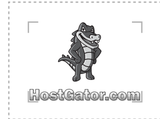
Faded Stacked Version Minimum Width 77x74 px