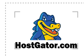
Tiny Color Stacked Version Minimum Width 50x30 px