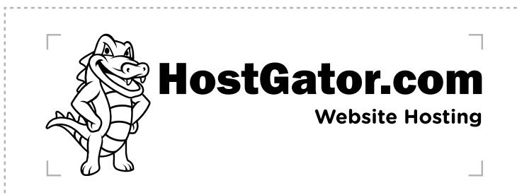
Black & White Horizontal Version Minimum Width 200x65 px