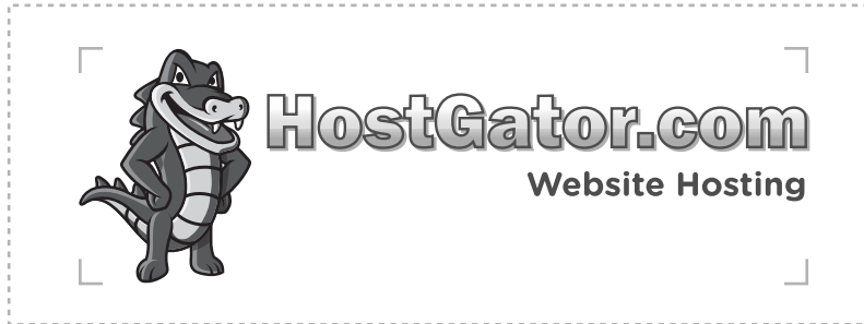
Faded Horizontal Version Minimum Width 200x65 px

This section shows acceptable layouts for Faded Logos. Faded Logos can be used for web pages, promotionals, rollover images, and more.