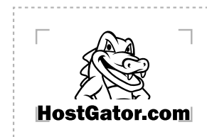
Tiny Black & White Stacked Version Minimum Width 50x30 px