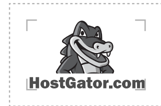
Tiny Faded Stacked Version Minimum Width 50x30 px