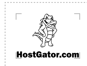
Black & White Stacked Version Minimum Width 80x77 px