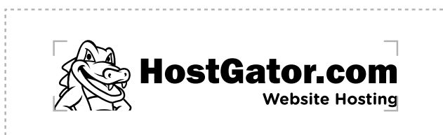
Tiny Black & White Horizontal Version Minimum Width 127x33 px