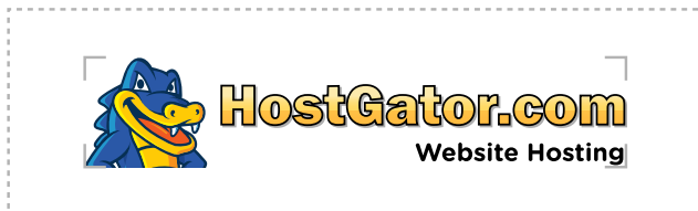
Short Color Horizontal Version Minimum Width 200x60 px